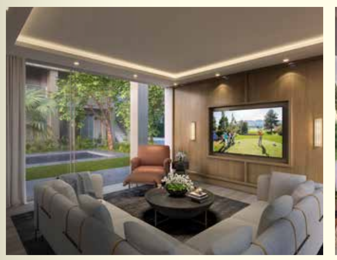
5. Living Room