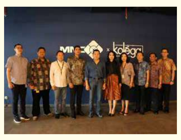
Opening MNC x Kolega