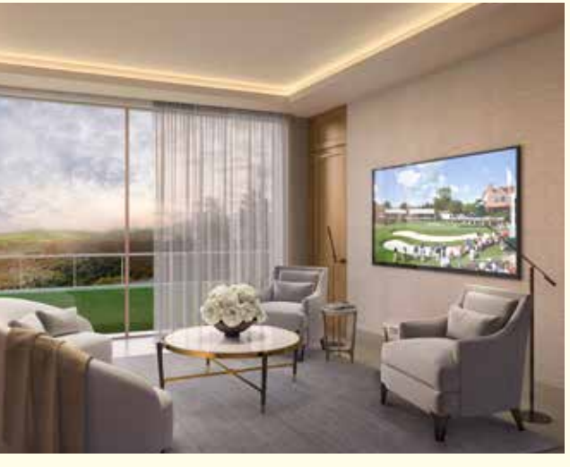
6. Second Level Sitting Area at Trump Residences Lido