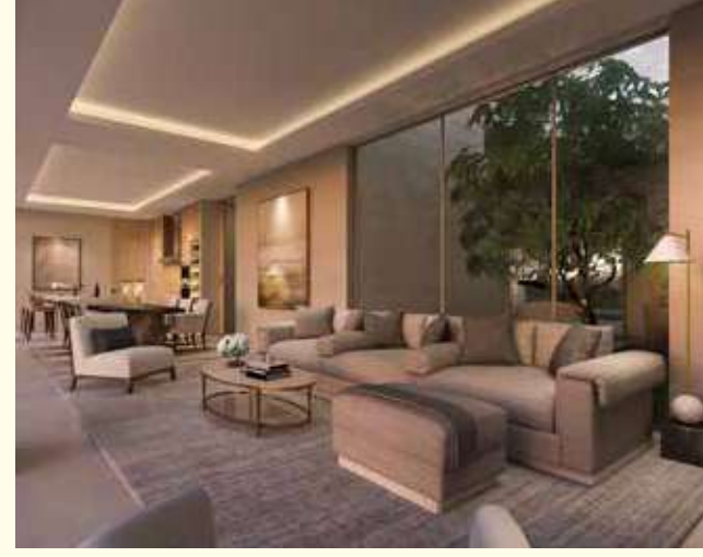
{\it 4. Family Room at Trump Residences Lido}\\