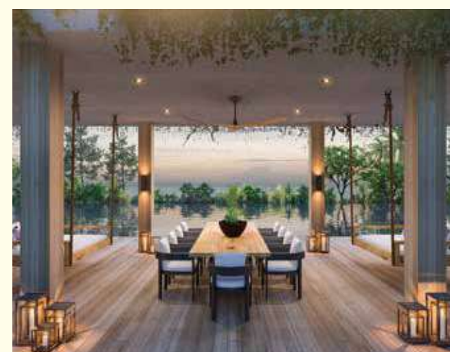
1. Outside Dining Area

MNC Bali Resort is perched on 102 hectares of rich land next to Tanah Lot in Tabanan, Bali. This integrated luxury lifestyle complex with magnificent, sweeping views over the rugged coastline features an exclusive collection of Trump-branded facilities for the ultimate getaway, including an 18-hole signature championship golf club, state-of-the-art beach club, 6-star luxury hotel and 144 ultra-luxury homes designed, furnished, and adorned with the finest.