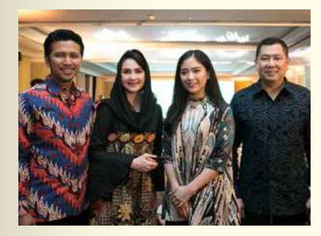
Grand Opening Oakwood Hotel & Residence Surabaya

MNC Fest 2019 is a collaboration amongst all business units in MNC Group. MNC Land organized a variety of exciting activities that embody the concepts of lifestyle, hospitality, and etertainment such as the Fun Golf and Fun Ride games and gave away prizes such as exclusive mechandises and a hotel voucher for Lido Lake Resort by MNC Hotel.