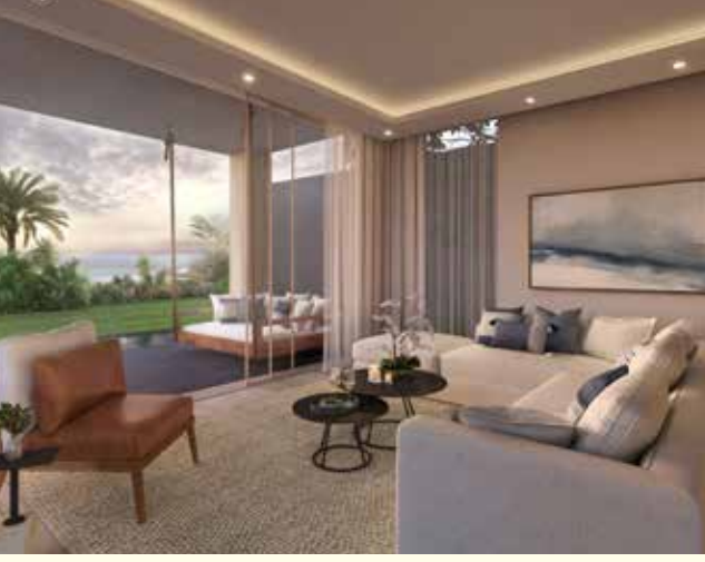
6. Family Room