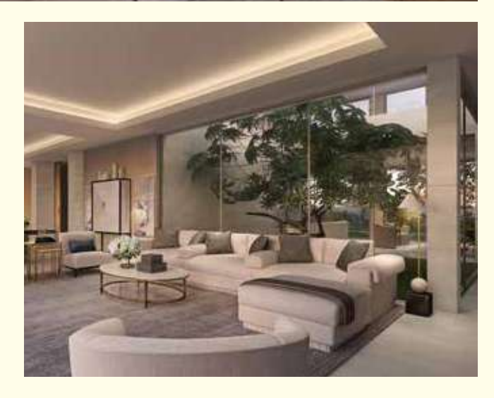
2. Family Room at Trump Residences Lido

1. Master Bedroom at Trump Residences Lido