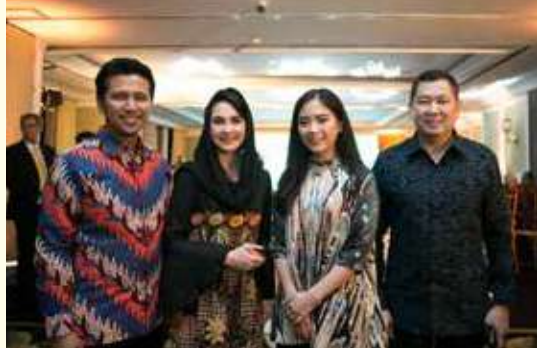
Grand Opening Oakwood Surabaya Deputy Governor of East Java & Chairman of MNC Group

← Grand Opening Oakwood Surabaya Chairman of MNC Group