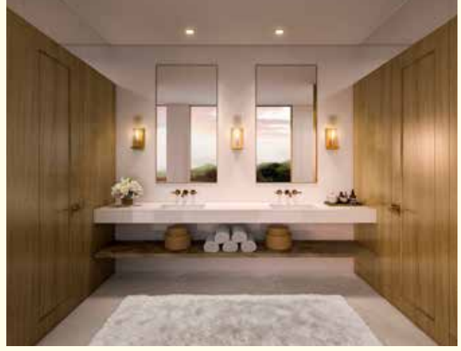
8. Master Bathroom at Trump Residences Lido