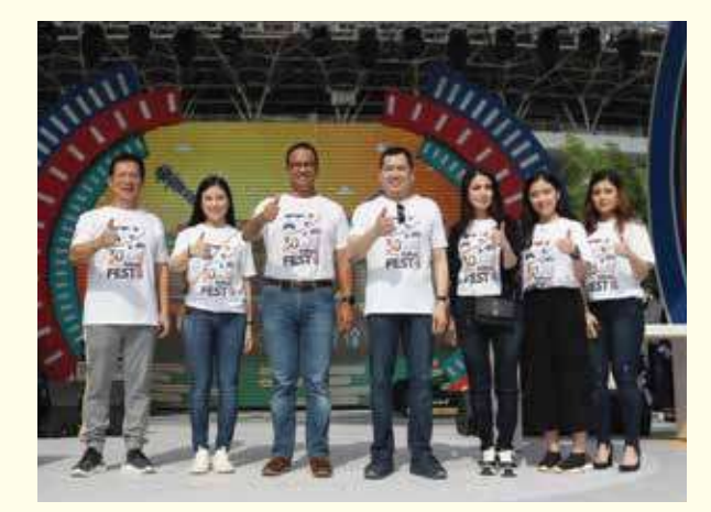
HUT MNC Group 30th

MNC Land collaborated with Kolega to develop MNC x Kolega as the most strategic and spacious coworking space in central Jakarta. Located on the 10th and 11th floors of Park Tower, Kebon Sirih, Jakarta, the MNC x Kolega coworking space comes with several services and room types , such as daily and monthly space rental, dedicated desk, office suites, meeting room, and event spaces that can be used to hold various events.