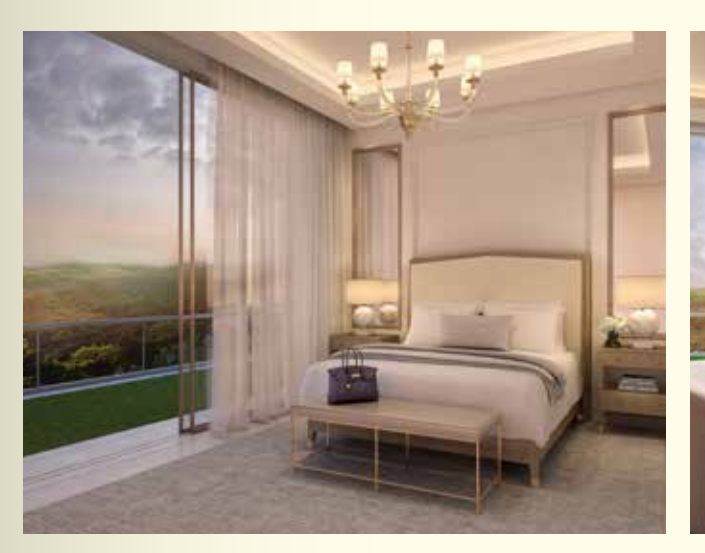
5. Master Bedroom at Trump Residences Lido