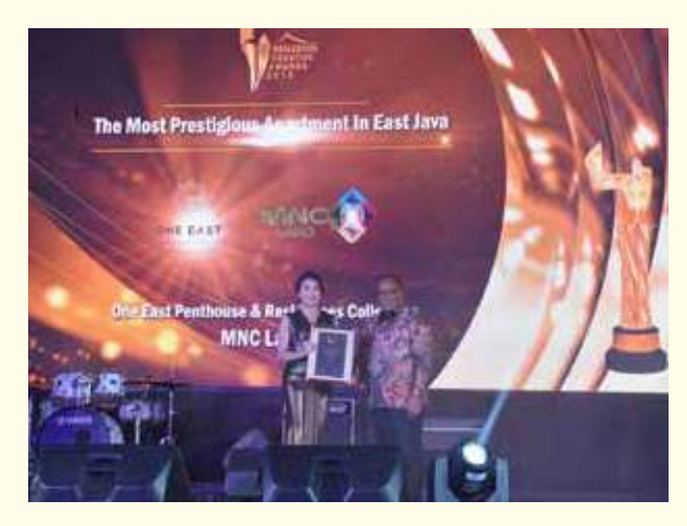
One East Residence in Surabaya Achieved Award as The Most Prestigious Apartment in East Java

He also mentioned four important things that must be considered by sales and marketing: the correct product, sales skills, product knowledge, and synergy.