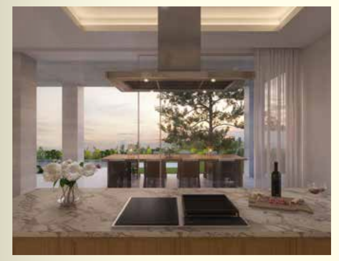
7. Kitchen at Trump Residences Lido