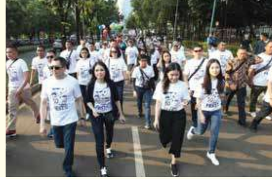
MNC Fest 2019 > Eco Fun Walk with Chairman & Chairwoman of MNC Group