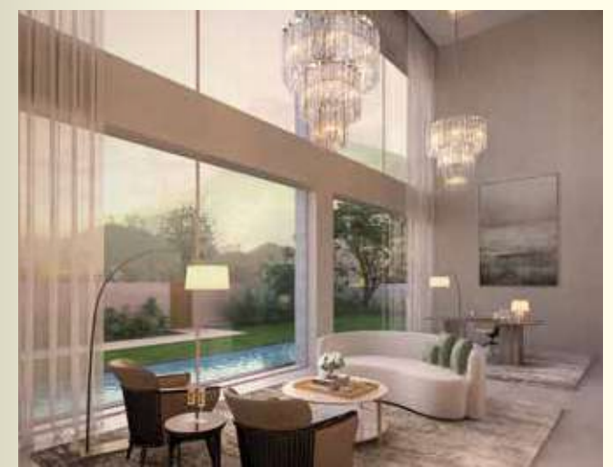
3. Living Room at Trump Residences Lido