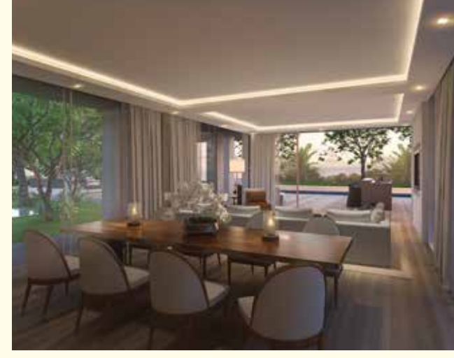
4. Dining Room