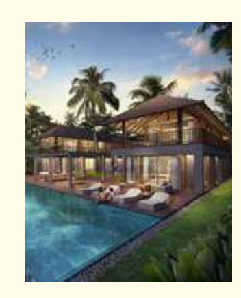
11 TRUMP RESIDENCES BALI