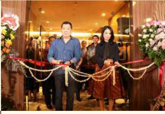
Grand Opening MNC x kolega Chairman & Chairwoman MNCGroup

✓ Grand Opening MNC x kolega All BOD MNC Land