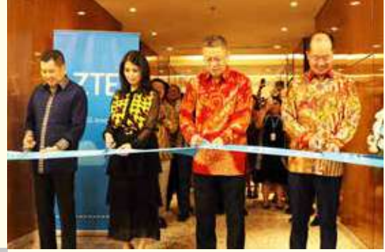
Ceremonial Opening > ZTE Office at Park Tower

✓ Pre-Launch Trump International Indonesia Donald Trump Jr. with Hary Tanoesoedibjo & BOD MNC Land