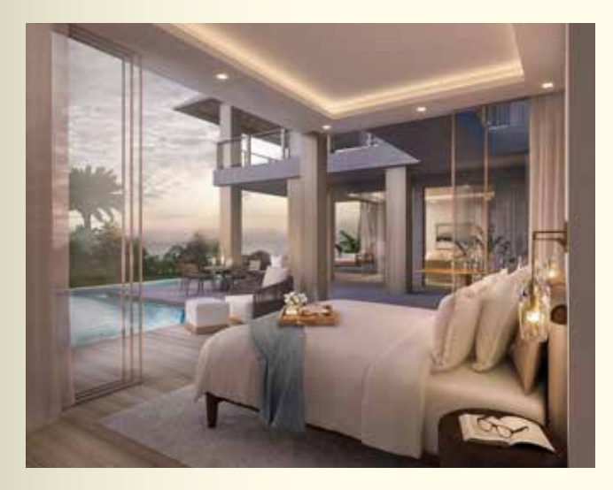
7. Secondary Bedroom